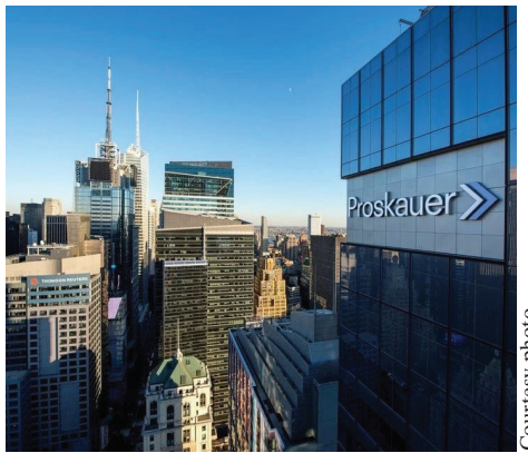
Proskauer Rose's office in Manhattan, New York.

The firm's nonequity partner ranks increased to 80 from 77 (3.9%), while its total partnership shrank by 1.3%, to 237 from 240.